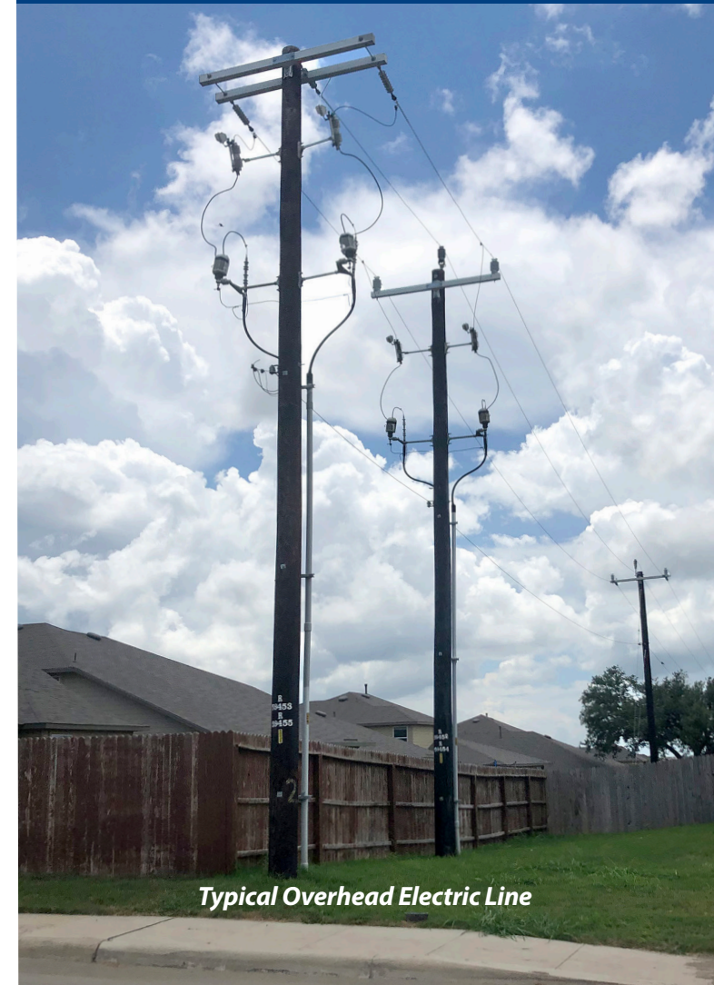
Typical Overhead Electric Line

RELIABILITY | CUSTOMER AFFORDABILITY | SAFETY SECURITY | RESILIENCY | ENVIRONMENTAL RESPONSIBILITY