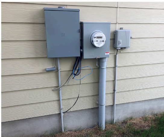
Underground Lines Connected to Electric Meter

CPS Energy is among the top public power wind energy buyers in the nation and San Antonio is #1 in Texas for solar energy capacity.